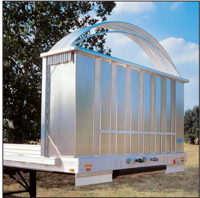
Aero's 22" wraparound model offers plenty of room for storing bows, tarps, side panels, and stakes. Holes in the top rail are specially designed for bow storage.

Strength and security for your driver and your load... and simple installation and all without adding a lot of weight to your trailer. Aero makes a complete line of good-looking, hard-working DuraLite bulkheads to fit your needs, each with attention to detail and quality you expect from Aero.