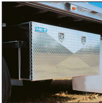
Standard single-door StorMor storage boxes look great and protect your equipment for the long haul.