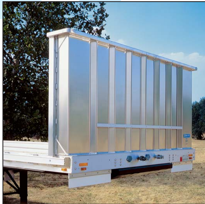
Aero's 10" wraparound model gives you excellent strength and protection while adding a minimum of weight to your trailer.