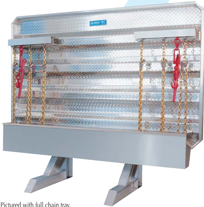
Pictured with full chain tray.

The I-beam upright post construction of Aero Cab Guards adds strength and rigidity to the entire unit without adding excess weight.