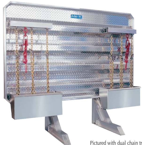
Pictured with dual chain tray.