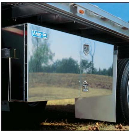
The StorMor double door design features no center post for ease of loading and unloading, with a special dual T-handle, keyed lock, and full length stainless steel hinges.