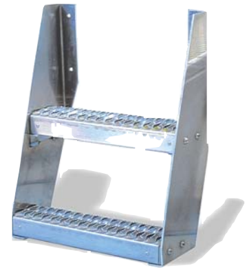
Aluminum grip steps provide solid footing protection.

Now you can have all the durability, dependability, and long-lasting good looks that have made StorMor the brand of choice among truckers across the nation; with pre-assembled front and top aluminum grip steps, or StorMor Saddle Boxes in five standard sizes. All are built tough to seal out the weather, lock tight for security, and maintain their attractive Tread Brite Diamond finish for many years to come.