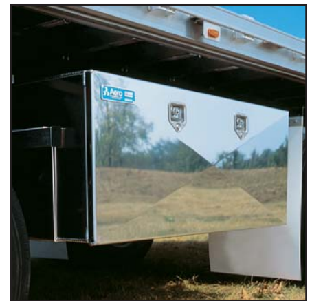
Doors available in polished or mill-finished aluminum doors.