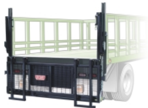
STANDARD FEATURE – Rearward Folding Rack for unobstructed access to rear of truck body on 42" (laden truck) or higher bed height trucks.