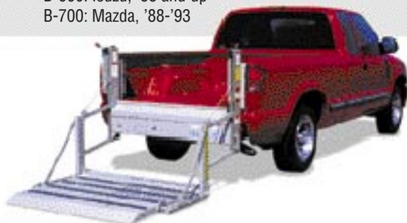
All gates painted in black prime

Eagle Lift reserves the right to modify, change or revise published specifications and furnish products so altered without prior notice.