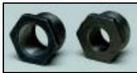
left 210838 right 210837