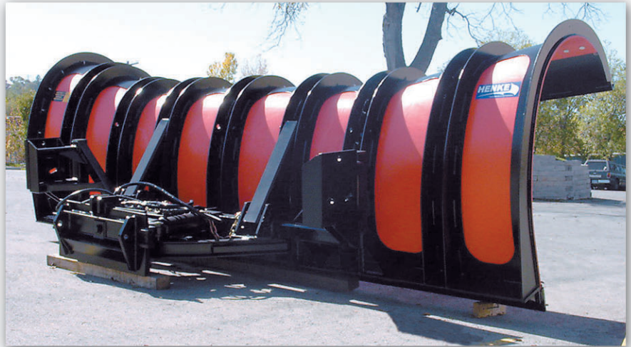
Airport Reversible Available with 3/8" Poly Inlay APX, 19 Foot Model