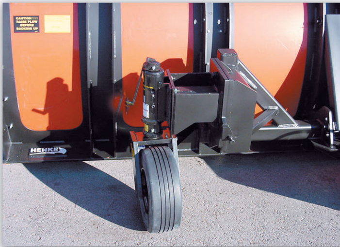
Heavy Duty Snow Wheel System Running Gear Assemblies