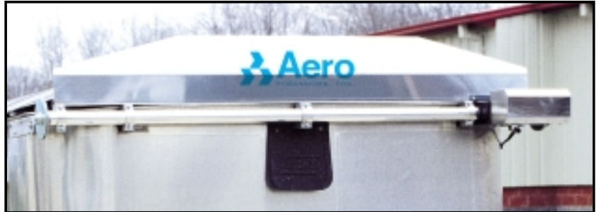
Aluminum (attractive, lightweight, no painting required).